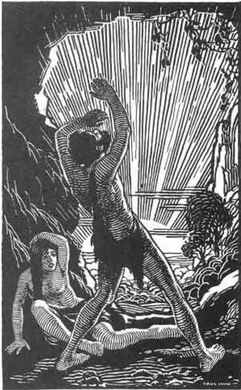
THE FIRST SUNRISE