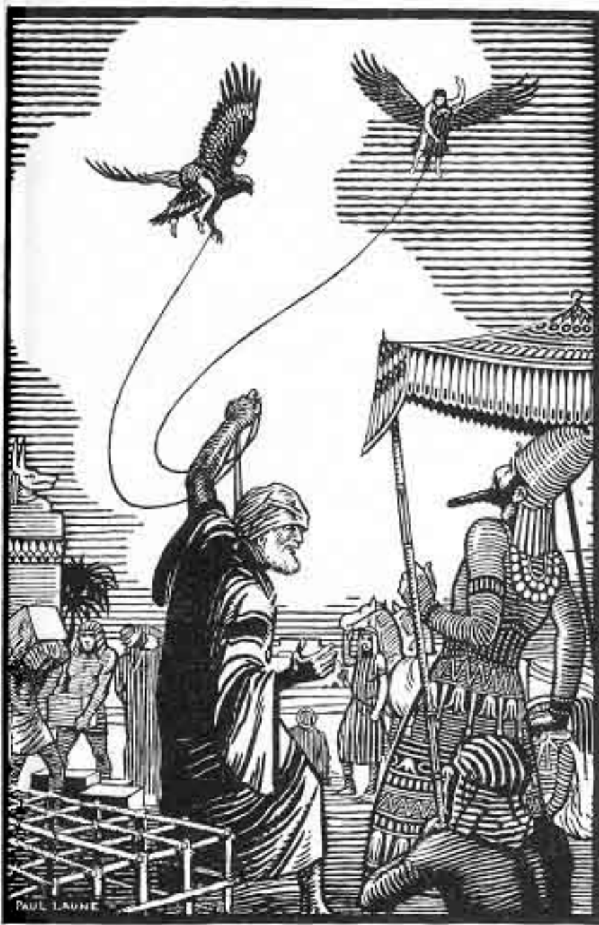
AHIKAR ANSWERS PHARAOH'S RIDDLE